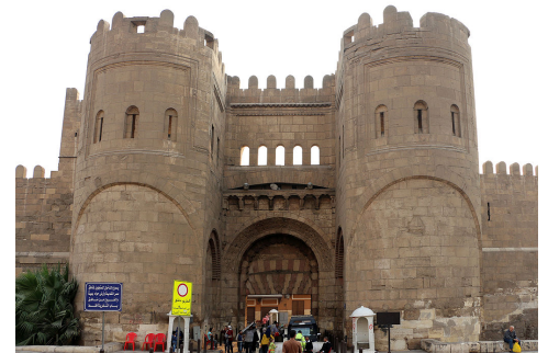
Gates of Cairo. (2022, January 22). In Wikipedia

After lunch, you will head toward the Old Gates of Cairo - Bab El Fotouh (Gate of Conquests) . The Gates of Cairo were gates at portals in the city walls of medieval Islamic Cairo, within the present day city of Cairo, Egypt. Bab al-Futuh is one of three remaining gates in the city wall of the old city.