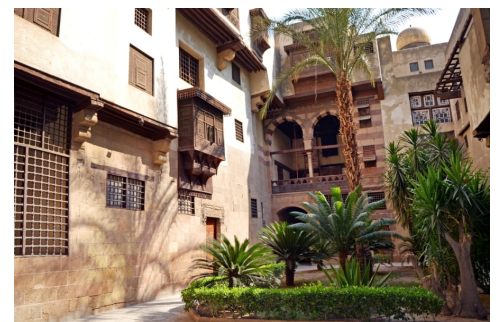
Beit El Seheimi (House of Suhaimi)

You’ll walk toward the ancient Islamic quarter with its narrow streets and bustling roadside shops and “wekalas”(trading places), that still actively trade in all sorts of wares. Walk down Al Moez Street until reaching the recently renovated Beit El Seheimi , one of the most impressive homes of the 17th century Islamic era.