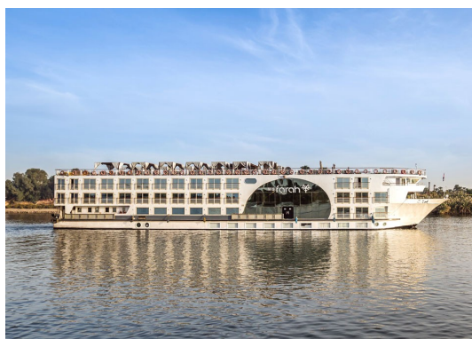
Farah Nile Cruise ( Photo gallery )

Attribution-NonCommercial-ShareAlike 2.0 Generic (CC BY-NC-SA 2.0)