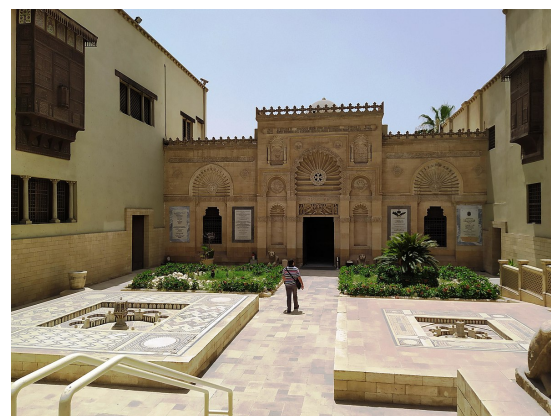
Coptic Museum