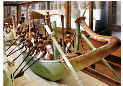
Egyptian National Museum of Antiquities