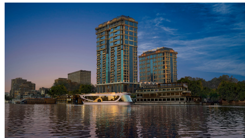
Four Seasons Hotel Cairo at First Residence (Photos and Videos)