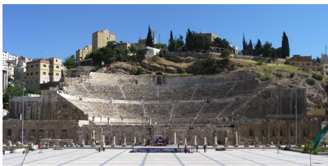
Roman Theatre By Dudva, Attribution-ShareAlike 4.0 International (CC BY-SA 4.0)

"If you've never been to the Middle East, Amman (and Jordan as a whole) is your perfect introduction. Not only was Amman a central crossing point of and the birthplace of several great civilizations, but it is also a city that is constantly in development, with a stark contrast between its east and west. Amman is westernized but maintains its Middle Eastern flair, brimming with mouth-watering food and incredibly hospitable people. Particularly remarkable is Amman's