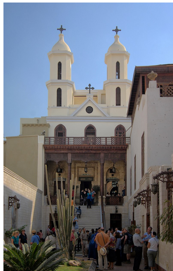
The Hanging Church By Berthold Werner Attribution-ShareAlike 3.0 Unported (CC BY-SA 3.0)