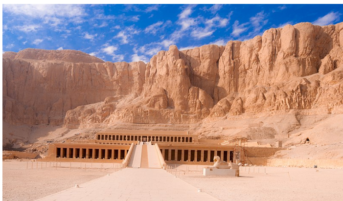
Template of Queen Hatshepsut (Public Domain)

Attribution-NonCommercial-ShareAlike 2.0 Generic (CC BY-NC-SA 2.0)