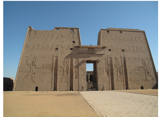
Temple of Horus in Edfu

In the afternoon, visit the Kom Ombo Temple which is unique in Egypt as a double temple and dedicated to two deities, Sobek (the crocodile god) and Horus (the falcon god Horus).