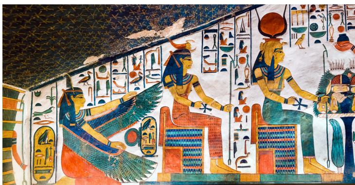
Tomb of Nefertari