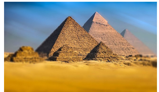
Pyramids of Giza

Our Egyptologist will escort you to one of the most important pyramids in Egypt, not normally visited by tourists. This southern extension of the necropolis of Sakkara is a field of Royal tombs about 3.5 k.m. long, only opened to tourists in 1986.