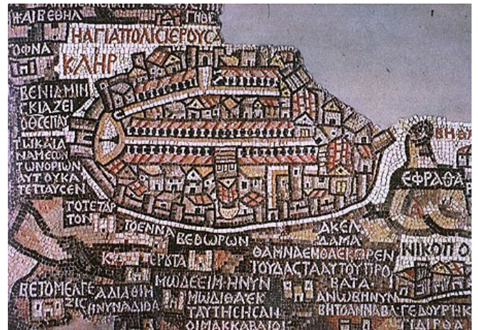
Madaba Mosaic Map