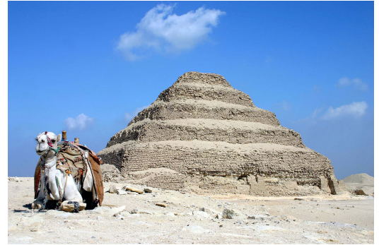
Step Pyramid By Charles J. Sharp - Own work, from Sharp Photography , sharpphotography , CC BY-SA 3.0

Elias Roviello , Attribution-NonCommercial-ShareAlike 2.0 Generic (CC BY-NC-SA 2.0)