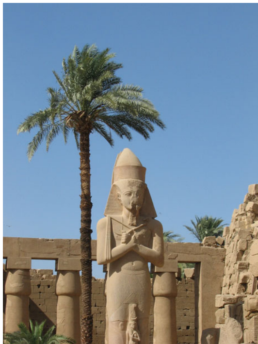
Template of Karnak (Public Domain)