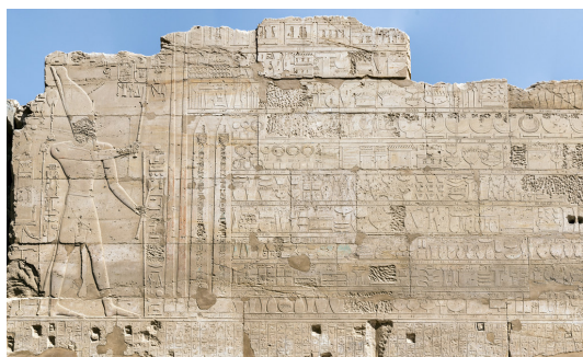
Temple of Karnak