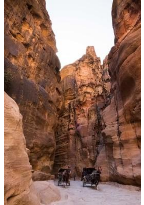
Carriage Ride Through Petra

Your hotel for the night is the world-class gorgeous Kempinski Dead Sea Ishtar Hotel (5-Star). Located at the lowest point on earth and inspired by the Hanging Gardens of Babylon, the hotel offers elegant rooms with the finest views of the Dead Sea or the Babylonian.