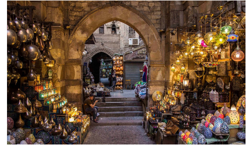
Khan El-Khalili Bazaar

Continue to the fascinating Khan El-Khalili Bazaar , reputedly the largest bazaar and most picturesque tourist destination in the Middle East. Originally founded as a watering stop for caravanserais in the 14th century, the bazaar is now famous for its labyrinth of narrow streets where you will find leather goods to herbs, perfumes, fabrics, and Pharaonic curiosities from local artisans.