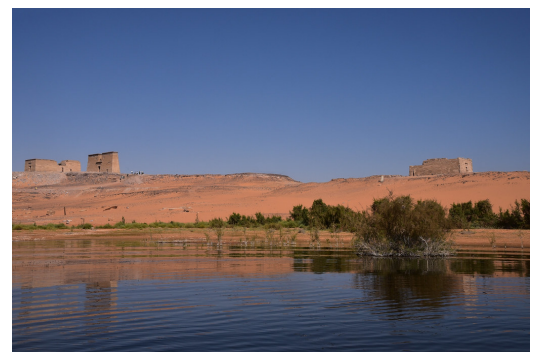
Lake Nasser Carol Raddato, Attribution-ShareAlike 2.0 Generic (CC BY-SA 2.0)