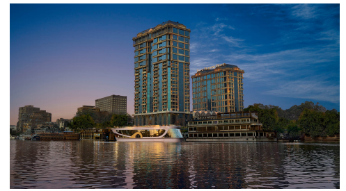
Four Seasons Hotel Cairo at First Residence (Photos and Videos)

Overnight at the upscale and elegant 5-Star Four Seasons Hotel Cairo at First Residence.