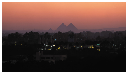
The Great Pyramids of Giza in the horizon (Four Seasons Hotel Cairo at First Residence)