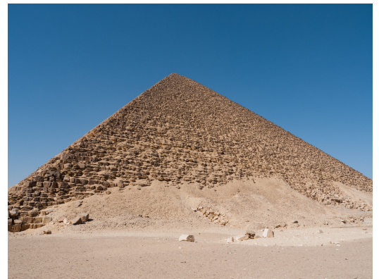
Red Pyramid Bykairoinfo4u Attribution-NonCommercial-ShareAlike 2.0 Generic (CC BY-NC-SA 2.0)