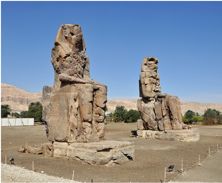
Colossi of Memnon

By Marc Ryckaert, Attribution 3.0 Unported (CC BY 3.0)