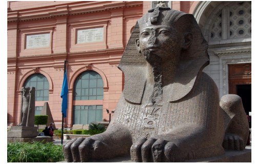
Egyptian National Museum of Antiquities

“The Egyptian Museum is the oldest archaeological museum in the Middle East, and houses the largest collection of Pharaonic antiquities in the world. The museum displays an extensive collection spanning from the Predynastic Period to the Greco-Roman Era. The architect of the building was selected through an international competition in 1895, which was the first of its kind, and was won by the French architect, Marcel Dourgnon. The museum was inaugurated in 1902 by Khedive Abbas Helmy II, and has become a historic landmark in downtown Cairo, and home to some of the world’s most magnificent ancient masterpieces.” - The Egyptian Museum