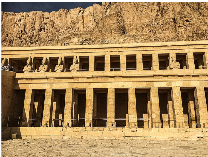
Valley of the Kings