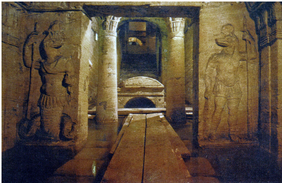
Catacombs of Kom el Shukafa