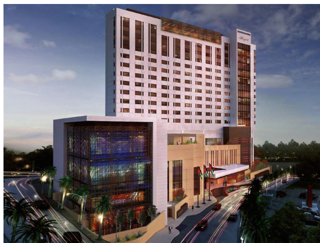
The Fairmont Amman Hotel