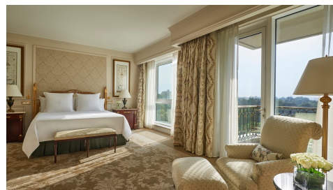
Deluxe Room (Four Seasons Hotel Cairo at First Residence)