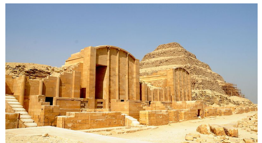
Step Pyramid of Djoser at Saqqar