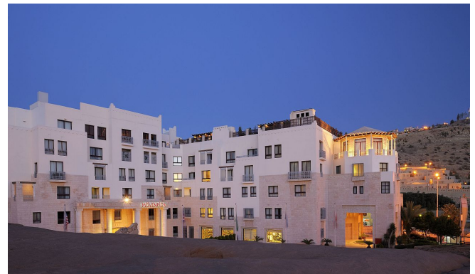
Movenpick Petra Resort