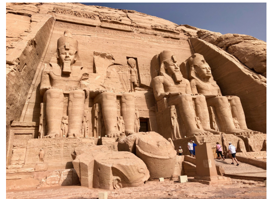
Great Temple of Ramses II (Public Domain)