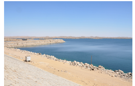
Aswan High Dam