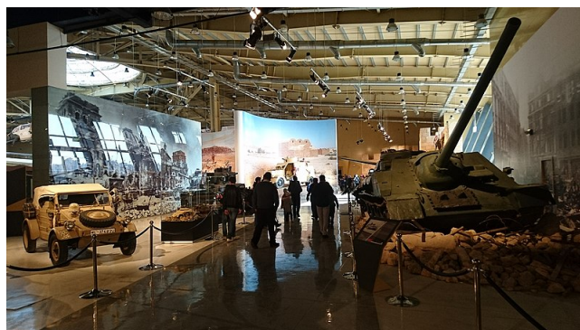
Royal Tank - Museum of Jordan