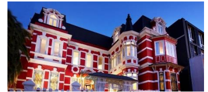
Hotel Palacio Astoreca

Overnight at Palacio Astoreca Hotel in Valparaíso ★★☆☆