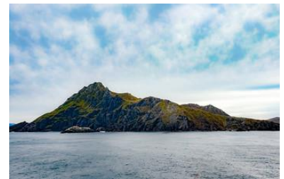
Cape Horn (CC BY 2.0)