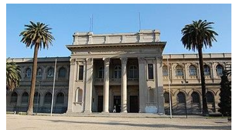
Chilean Natural Museum of History CC BY-SA 3.0