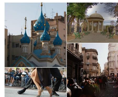
Photo montage of the Buenos Aires district of San Telmo