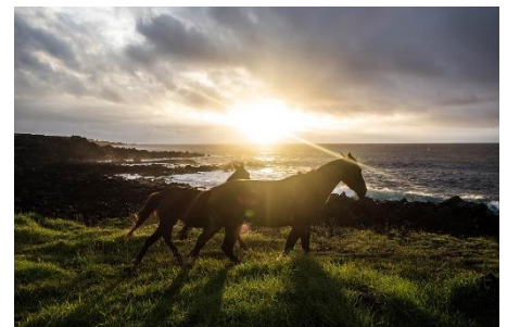
Easter Island - Horses