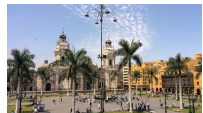
Plaza de Armas