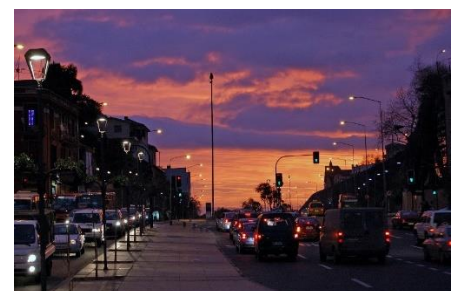
Viña del Mar