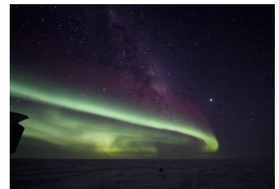
Lights of Ushuaia (National Science Foundation)