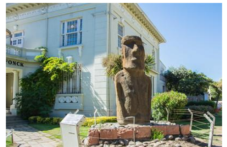
Genuine Moai Statue (CC BY 2.0)