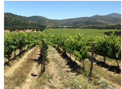
Matetic Winery Casablanca Valley (CC BY 2.0)

Overnight at Mandarin Oriental in Santiago ★★★★★