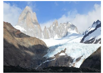
Patagonia Fitz Roy

Overnight at Cruceros Australis (Ushuaia to Punta Arenas) www.australis.com