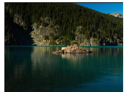
Lake Garibaldi (CC BY-NC-ND 2.0)