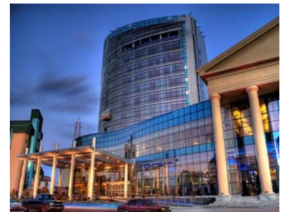
Hotel Dreams del Estrecho