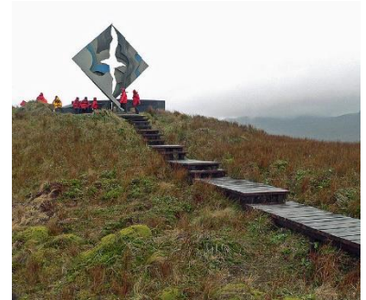
Cape Horn Monument (CC BY-SA 3.0)