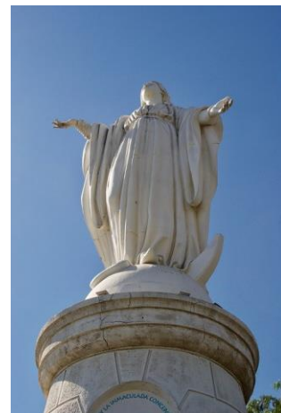
Cerro San Cristobal