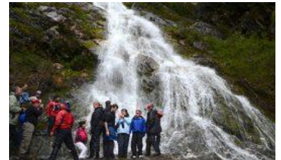
Magellanic forest to a glacial waterfall