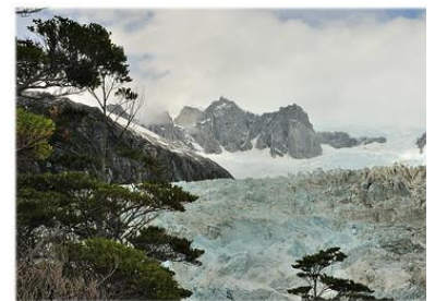
Pia Glacier (CC BY-NC 2.0)

After disembarking, we take a short hike to gain a panoramic view of the spectacular glacier, which extends from the mountaintops down to the sea or a longer much more difficult walk up a lateral moraine of the old Pia Glacier . No one knows for certain how the hulking mass of snow and ice got its feminine moniker, but one theory says it was named for Princess Maria Pia of Savoy (1847-1911), daughter of the Italian king.