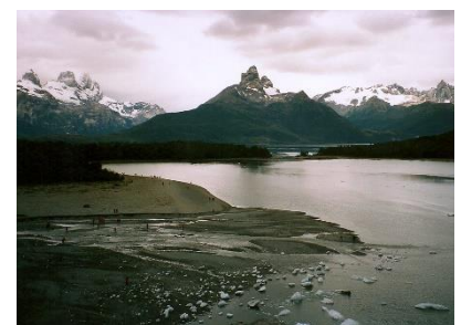
Agostini Sound (also known as Agostinia Fjord) Aguila Glacier (CC BY-NC 2.0)

This morning, we will disembark and go for an easy walk around a lagoon, which was formed by the melting of the the melting of the Águila Glacier and will reach a spot right in front of the glacier with stunning views.