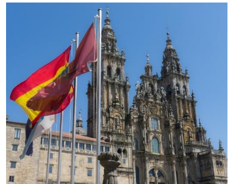
Santiago De Compostela Cathedral