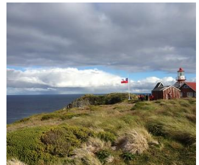
Cape Horn lighthouse (CC BY-NC-ND 2.0)