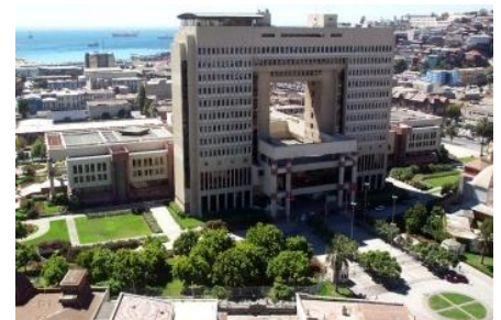
National Congress of Chile (CC BY-SA 3.0)

A must-see when visiting Valparaiso is the Sotomayor Square (Plaza Sotomayor) , known for its eye-catching monument dedicated to the seamen who lost their lives in the Iquique Naval Battle.