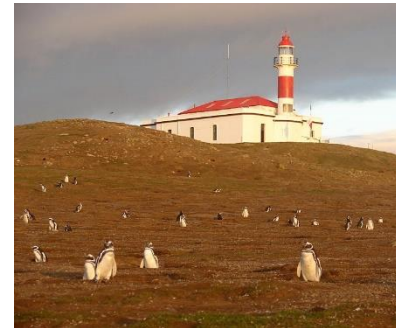
1902 lighthouse on Magdalena Island