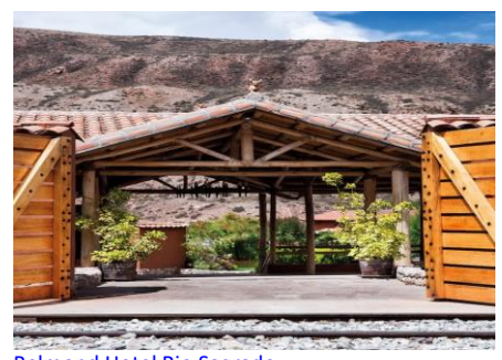
Belmond Hotel Rio Sagrado