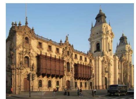
Cathedral of Lima