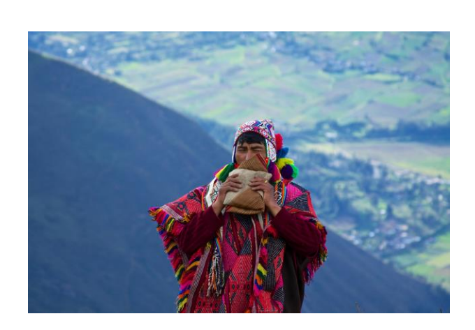
Shaman in the Apu mountains

Overnight at <u>Belmond Palacio Nazarenas</u> – built on Inca Foundations where rich history meets modern indulgence in Cusco's fairytale hideaway.