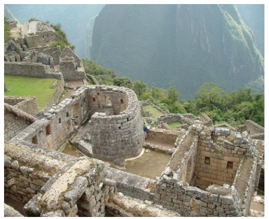
Machu Picchu Ruins