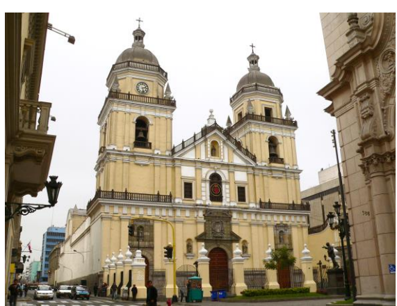
Basilica and Convent San Pedro

You will visit the city of Cusco, declared as a World Heritage Site by UNESCO and a place of a "particular essence". The tour will start at the Koricancha temple, an ancient Inca palace and main worship center of the Sun god, where the order of the Dominicans built a precious church that lies at the top. Then, you