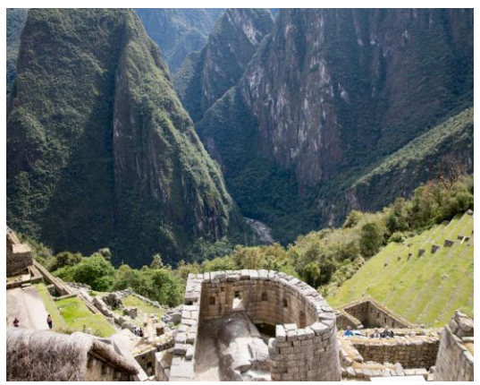
The Temple of the Sun, Machu Picchu