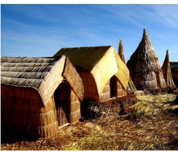
Lake Titicaca, Peru