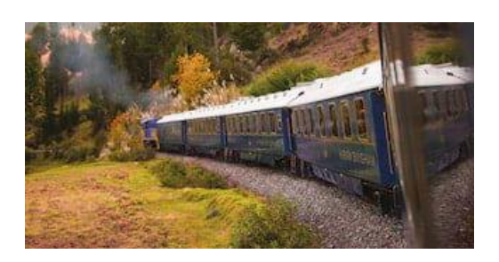
Hiram Bingham Train