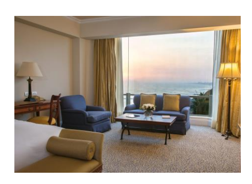
Belmond Miraflores Park

Overnight at <u>Belmond Miraflores Park</u> – a true urban sanctuary beside the city's cultural gems