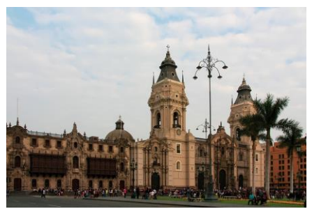
Historic Centre, Lima