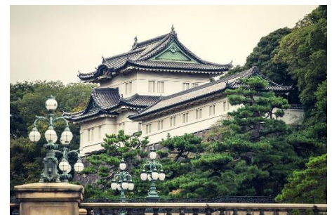
Imperial Palace, Tokyo

Tokyo, which translates to “Eastern Capital” is the capital city of Japan and the most populous greater metropolitan area in the world. It harbors both the seat of the Japanese Government and the home of the Emperor. Previously known as Edo, it was renamed Tokyo after Emperor Meiji moved his seat from Kyoto, in 1868.