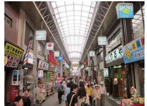
Asakusa District, Tokyo

The Asakusa District is the center of Tokyo's shitamachi , or "low city". Historically, Asakusa was Tokyo's leading entertainment district. During the air raids of WWII, large parts of Asakusa were destroyed, including the entertainment venues. Regardless, Asakusa thrives and is home to the Nakamise, a shopping district that provides traditional wares and local cuisine and focuses on preserving the atmospheres of past decades