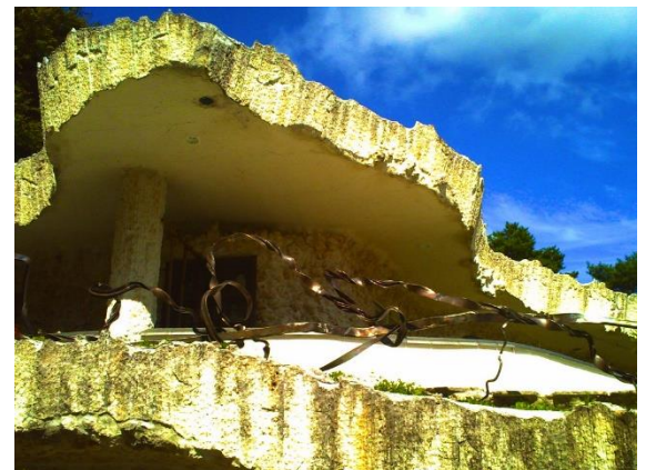
Kubota Itchiku Museum