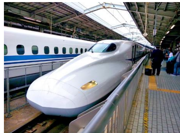
Bullet Train (Shinkansen)