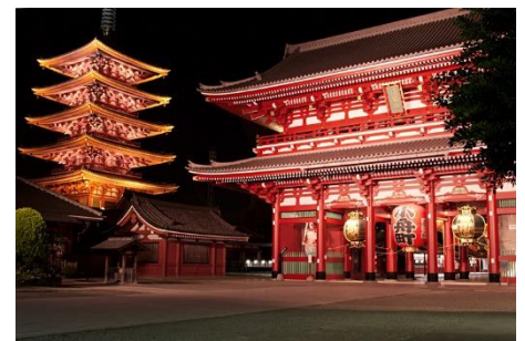
Senso-ji, Asakusa District

After lunch, the group will enjoy a traditional Japanese Tea Ceremony and visit the Tokyo Tower for a beautiful panoramic view of the sprawling metropolitan area.