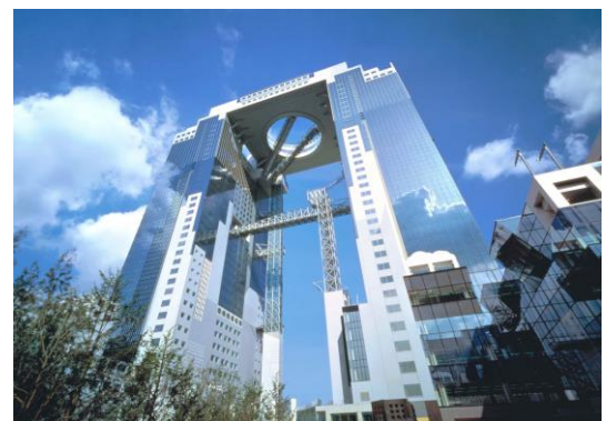
Umeda Sky Building