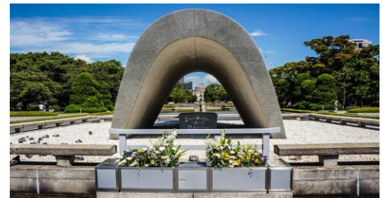
Hiroshima Peace Memorial Museum and Park

During the afternoon, the visit will continue at Peace Memorial Museum and Park , a poignant and touching tribute to Hiroshima itself as the first city in the world to fall victim to the atrocities of nuclear warfare. The Memorial was built adjacent to the iconic Genbaku Dome , which was the only structure left standing in the area following the atomic bomb explosion on August 6, 1945. This resonant and peaceful space was built at a site of absolute chaos, and serves as a reminder of the power we hold over one another.