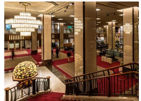
Imperial Hotel, Tokyo