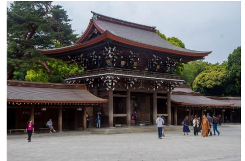
Meiji Jingu Shrine

Overnight at the Imperial Hotel (five-star).