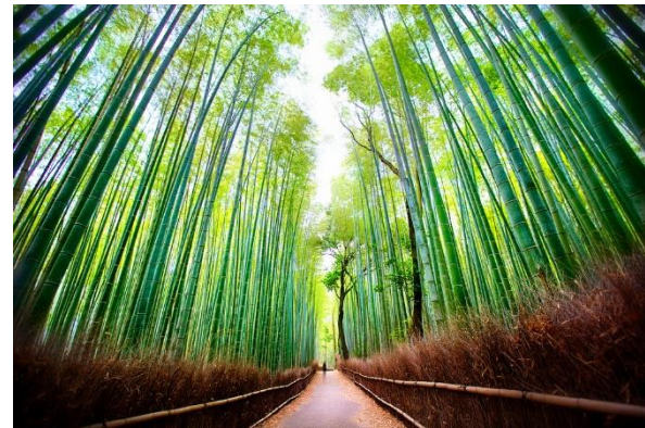
Sagano Bamboo Grove