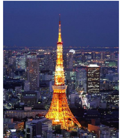
The Tokyo Tower

Overnight at the Imperial Hotel (five-star).