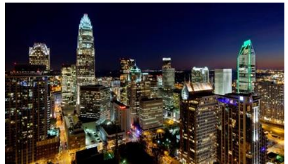
Charlotte, NC skyline