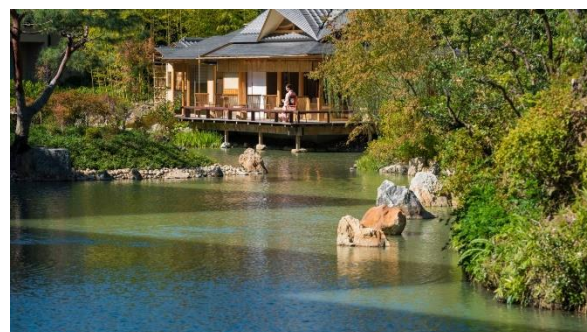
Four Seasons Hotel Kyoto