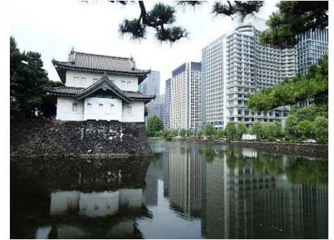
Imperial Palace, Tokyo

The accompanying gardens are works of art in themselves. Crafted from part of the original castle compound, the gardens allow you to get up-close views of the massive stones used to build the castle walls. The number of visitors at any given time is limited, so an enveloping sense of calm will always be present.