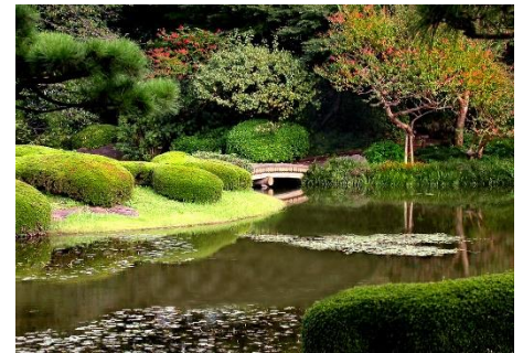
East Garden of the Imperial Palace

First the group will visit the Imperial Palace and East Garden. The Imperial Palace is the primary residence of the Emperor of Japan and his family. A large area, the complex contains the private residences of the Imperial Family, as well as museums, archives, and administrative offices. Some form of castle has been present on the grounds since 1457, and the current buildings reflect an incredible blend of history and architecture. Guests should note that because this is the residence of the Imperial Family, no buildings may be entered.