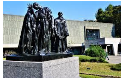
National Museum of Western Art