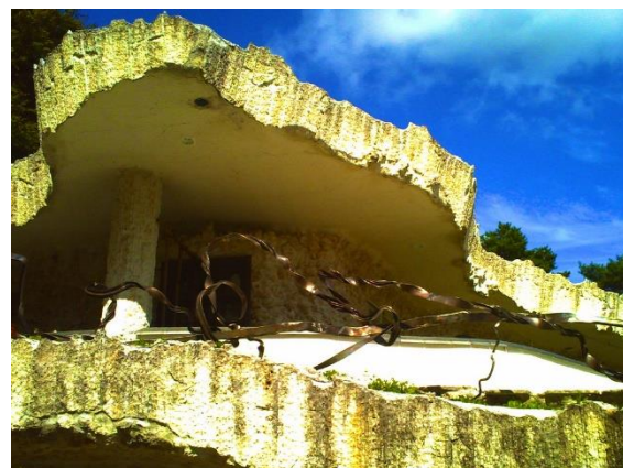
Kubota Itchiku Museum